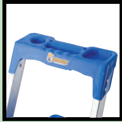
Guardrail tray to hang your tools safely.