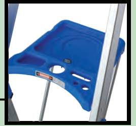
Tray that conveniently holds tools, paints and supplies.