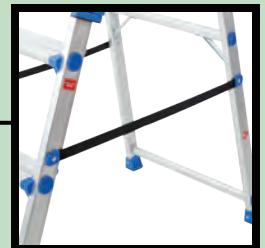
High quality webbing spreader.