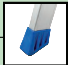
Durable polypropylene (PP) plastic feet.