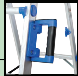
Handle carrier to ease user in carrying the ladder.