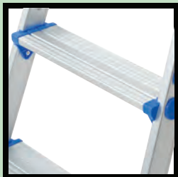
Wide anti-slip steps feature.