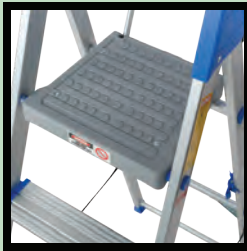
Wider platform with strong heavy duty body construction.